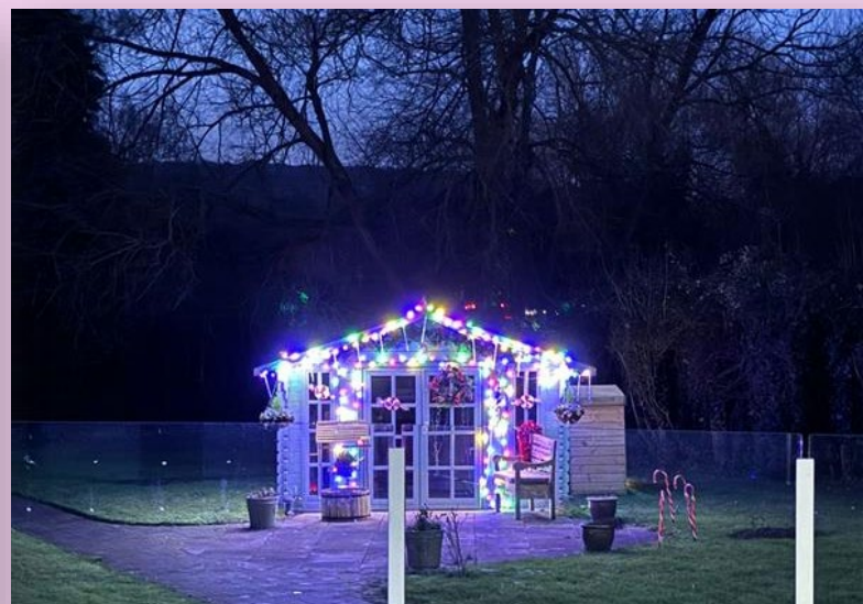
Sparkling Santa's grotto!